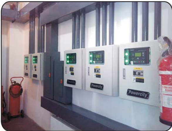
ABB 250A MCCB w/ INTERLOCKED TRANSFER MOTOR