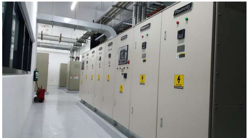
A Powercity Switchgear supplied and installed in an IT center.