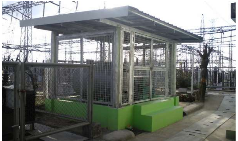
A Powercity 25 KVA generator, 1,000 liter fuel tank, and air-cooled steel shelter supply project of Powercity Corporation for a telecom facility collocated in a power grid.