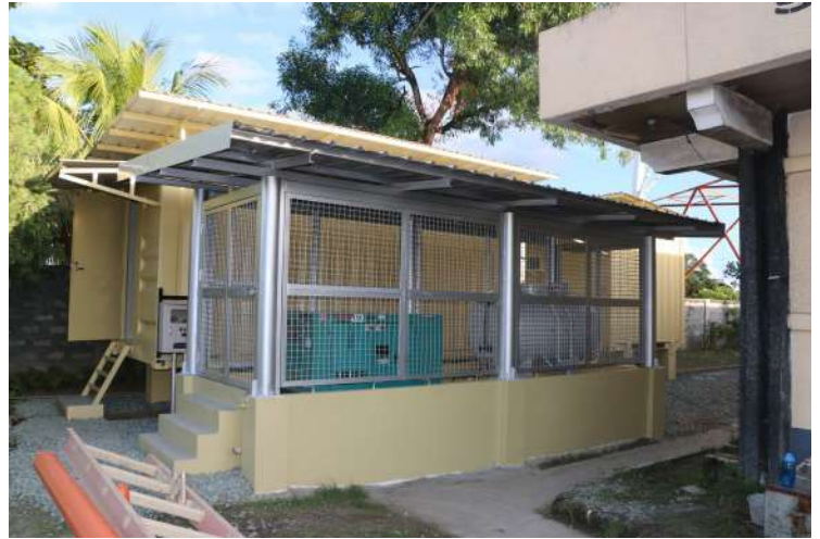
A Powercity 25 KVA generator, 1,000 liter fuel tank, and air-cooled steel shelter supply project of Powercity Corporation for a telecom facility.