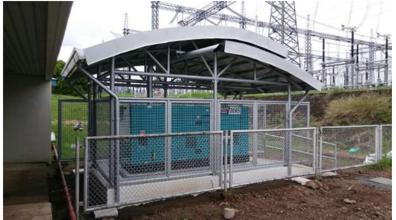
A Powercity 200 KVA generator and air-cooled steel shelter supply project of Powercity Corporation in a power grid.

Harris Communications, USA Huawei Technologies, Philippines Kentitsu World Express Inc., Paranaque City Manulife Insurance Company, Makati City Namsam Engineering, Thailand National Grid Corporation of the Philippines (NGCP) Petron Station, Quezon City Philippine Navy Piax Realty and Development Corp. PJ Lhuiller Group of Company, Makati City Power Asia, Libis, Quezon City Prestige Cars, Makati City Qualitia Realty and Development Corp., Makati City RSI Dialysis Center, Makati City Security Bank Smart Communications Southkey Development Corp., Alabang Sun Cellular Triple Star, Taguig Universal Farmville, Batangas We Lead Comtech, Cavite WTEI Realty Development Corp., Palawan ...and more!